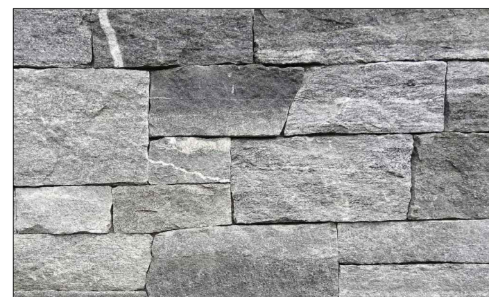
STONE VENEER- COLOR: COLORADO GREY